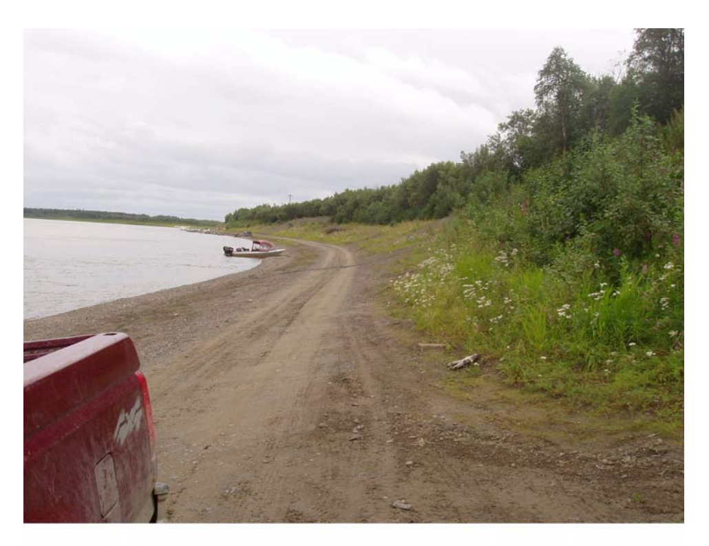
N 61° 34.965' W 159° 32.182' Aniak P1011247 Photo 3. Reach 3, Looking upstream along the Kuskokwim River.