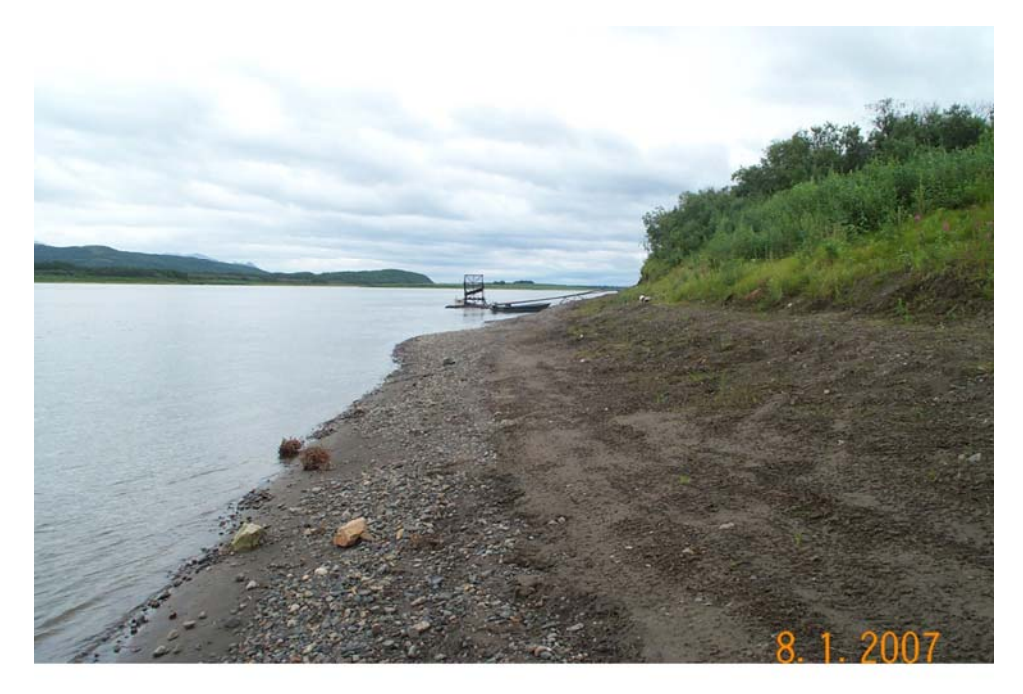
N 61° 35.272' W 159° 33.517' Aniak DCP_2474 Photo 2. Reach 2, West end of the runway looking upstream along the Kuskokwim River.