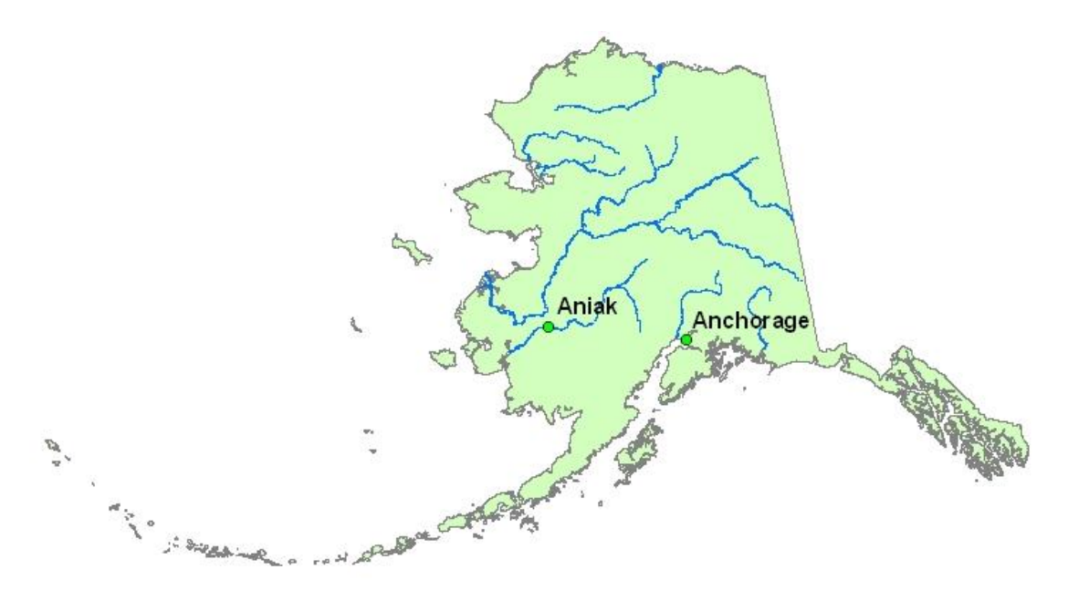
Figure 1: Aniak Location & Vicinity Map